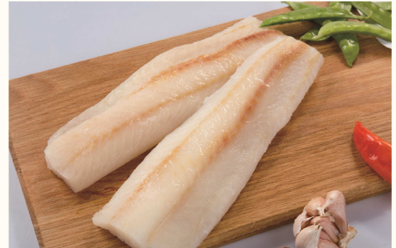
Southern Blue Whiting Fillet | ブルーホワイティングフィレー | 南藍鱈开片