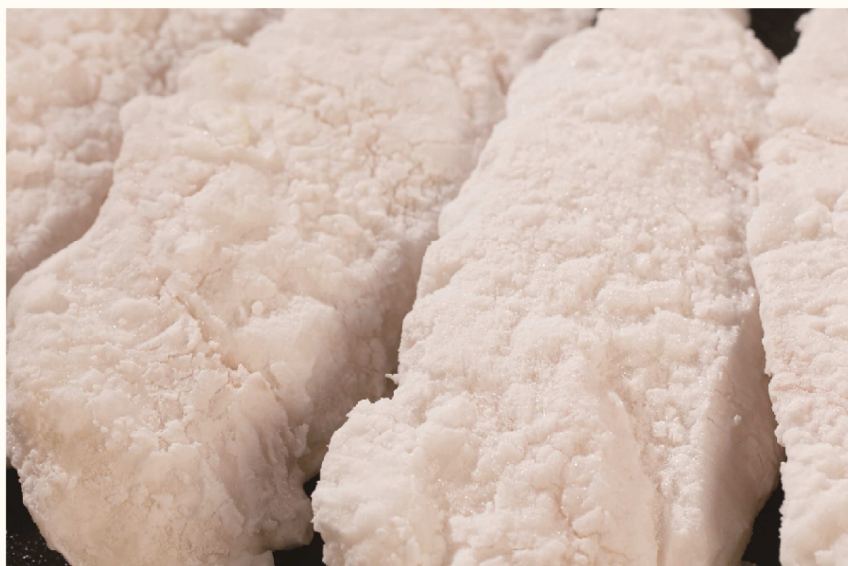
Starched Hoki Portion