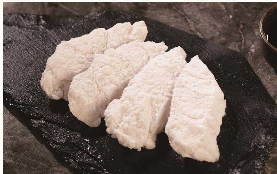
starched Hoki Portion