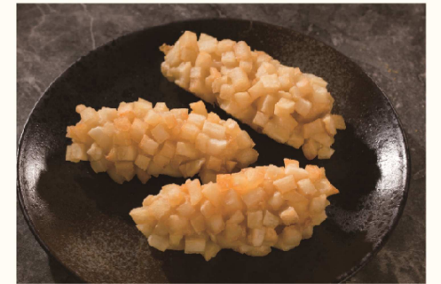
Hoki Fish & chips Strip