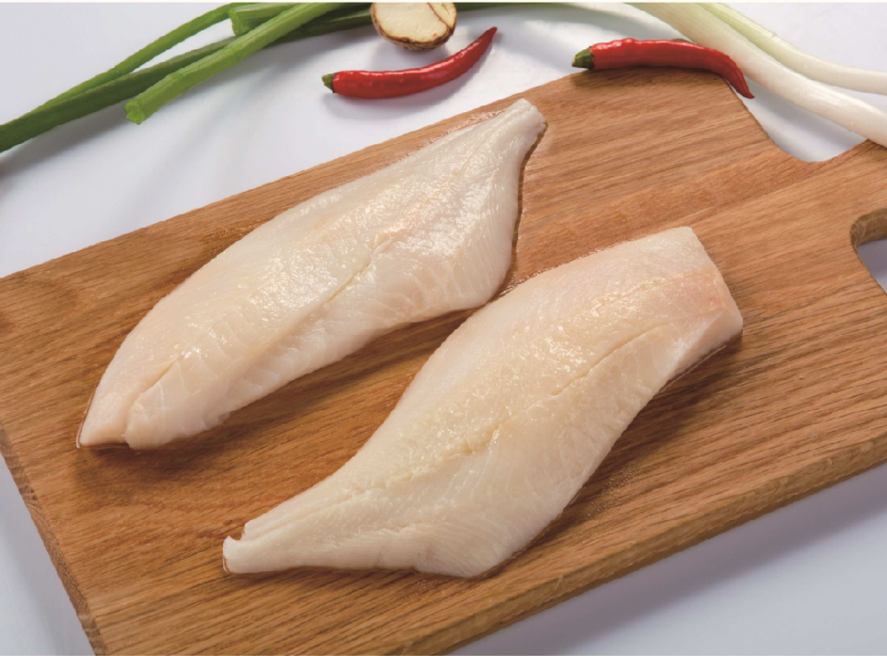
Black Oreo Dory Fillet | ブラックドリフィレー | 黒海魴魚开片