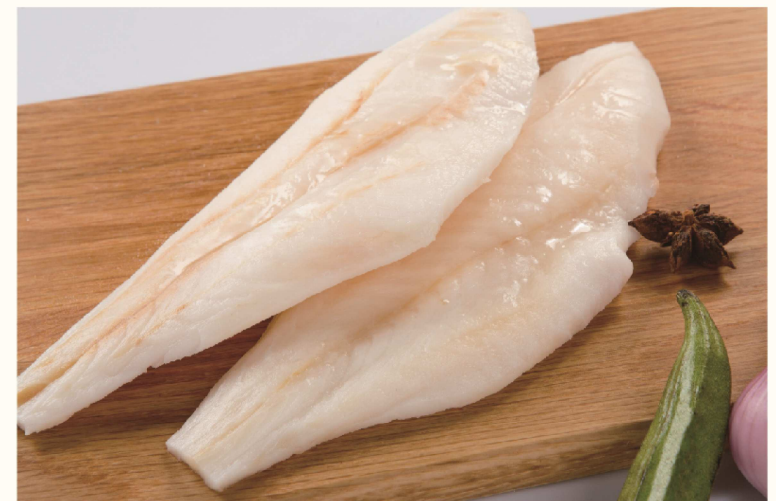
Orange Roughy Fillet | オレンジラビフィレー | 加吉魚开片